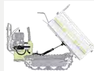
Load body hydraulic tilting kit.