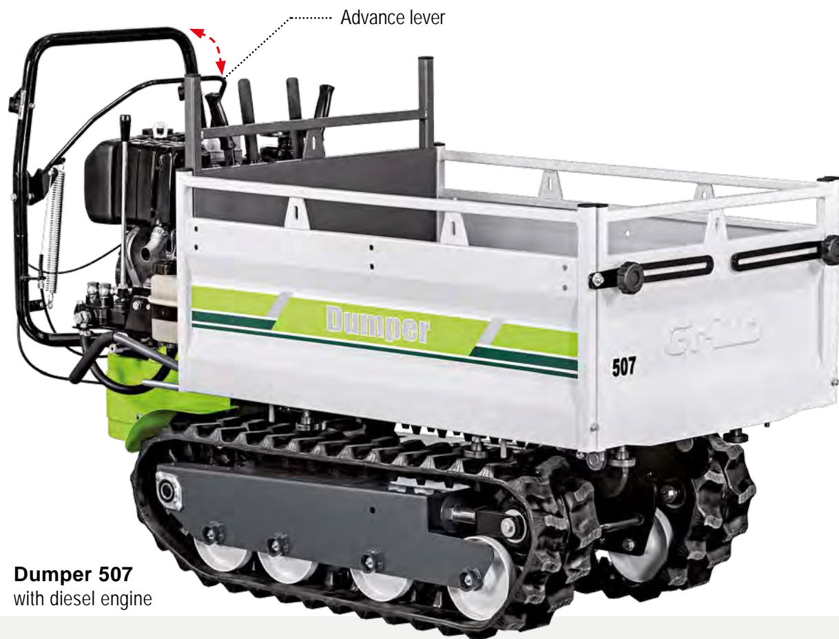
Dumper 507 with diesel engine

Its levers are comfortable and easy to operate and the tracks are made of rubber with steel mesh. This tracked carrier is fitted with powerful 270-301 cc petrol or 349 cc diesel engines with recoil or electric start to ensure not only a loading capacity of 500 kg but also the use of several different accessories. Both engines on the D 507 have high torque at low r.p.m, which is a major feature for these new generation, modern engines producing low emissions and reduced fuel consumption.